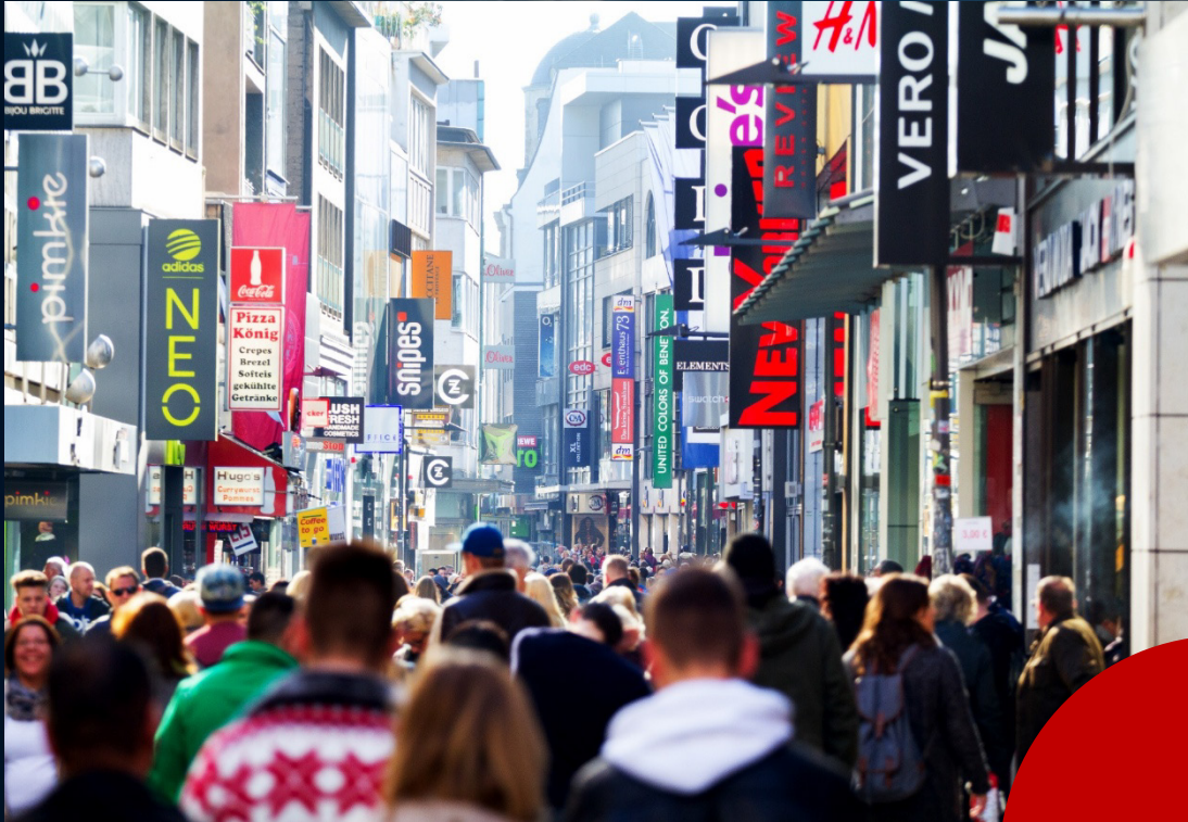
Einkaufswahn, Aktionismus, Medienkonsum, etc.