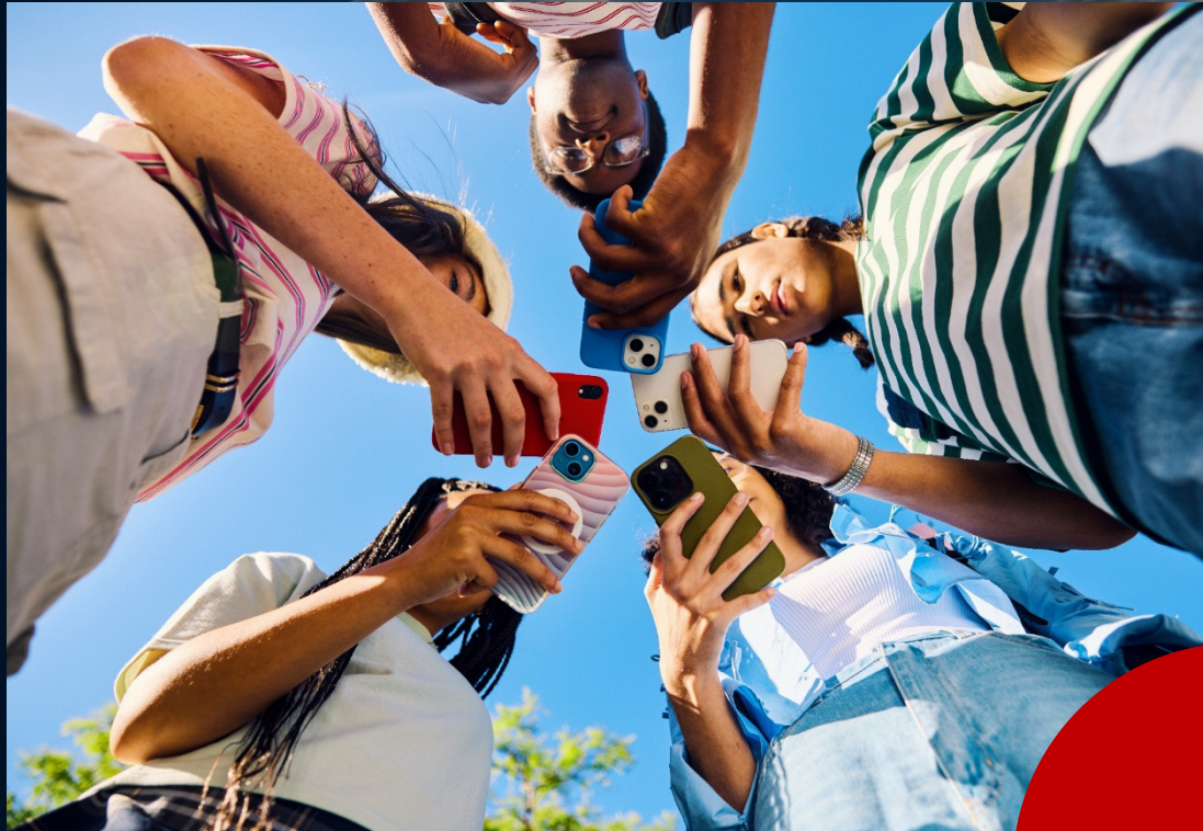
Social media, Internet, Gaming, etc.