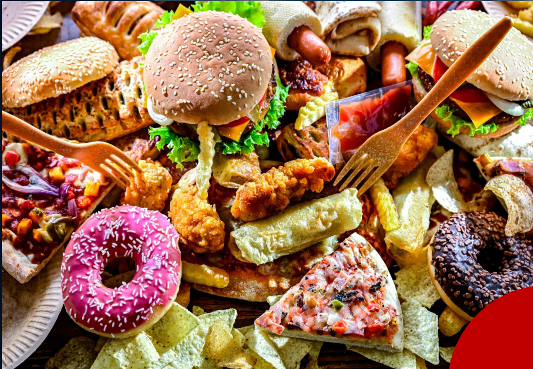
Quality, quantity, and type of nutrition, etc.