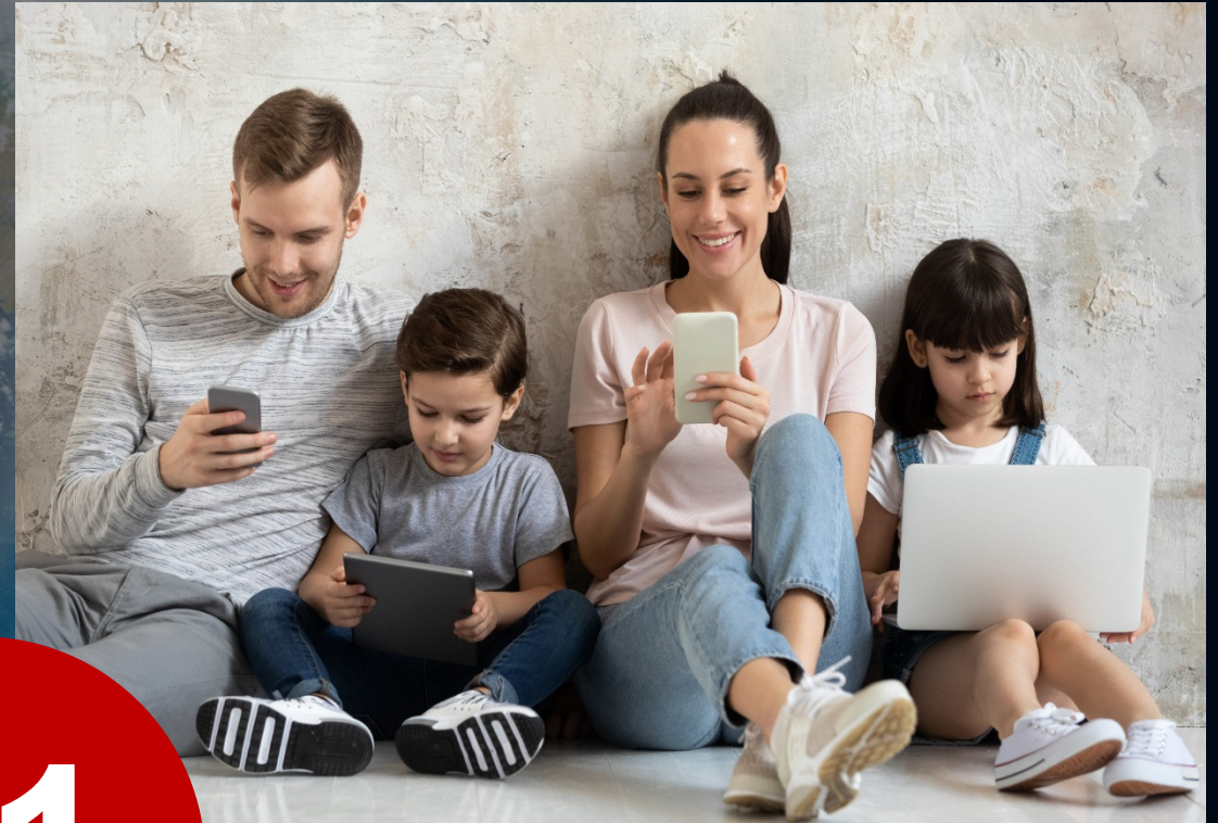
Social media, Internet, Gaming, etc.