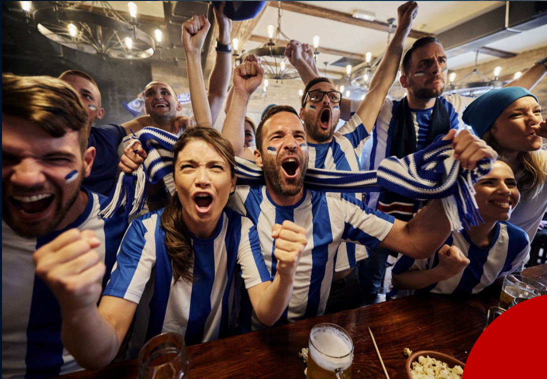
Football, mass events, wars, etc.